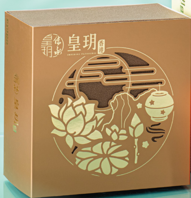
Classic Assorted Lava Mooncakes (8pcs) Lava Custard, Lava Sesame Mooncake

A fusion of tradition and modern design which revolutionizes the traditional mooncake tin box design. The unique champagne gold and amber orange colors, completed with exquisite paper art. Elegant and presentable.