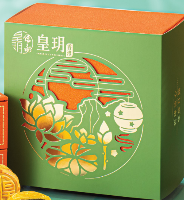
Savoury Assorted Lava Mooncakes (8pcs) Lava Custard, Lava Green Tea Mooncake