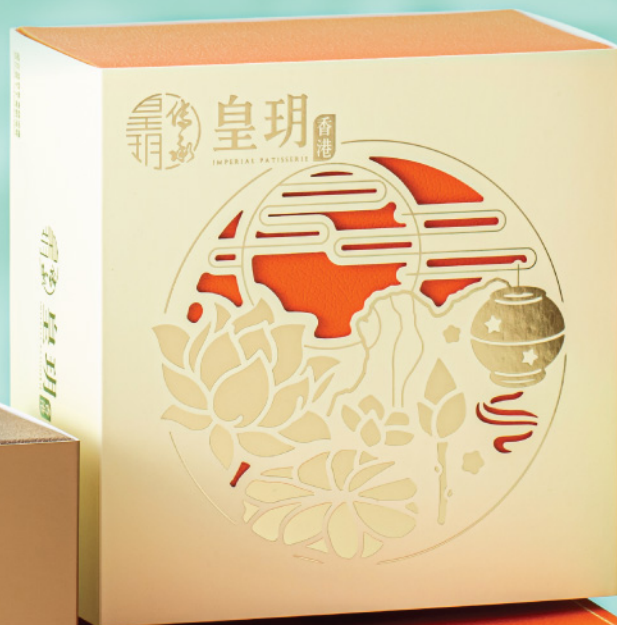
Lava Custard Mooncakes (8pcs)